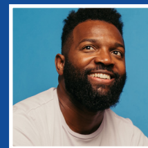
Baratunde Thurston, June 1