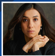
Nadia Murad, May 30